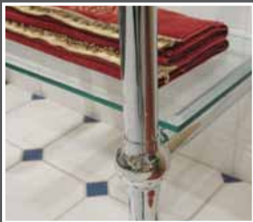
Optional Shelf Support (SS) for lower shelf (shelf not included)