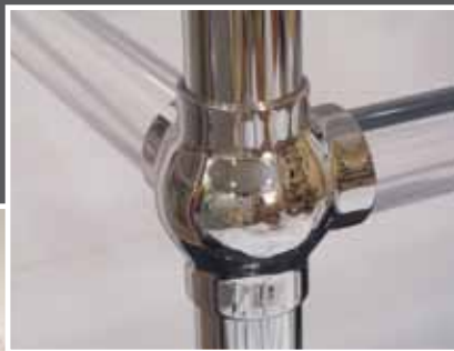
Optional Acrylic Rods