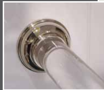
Wall Flange with concealed screws