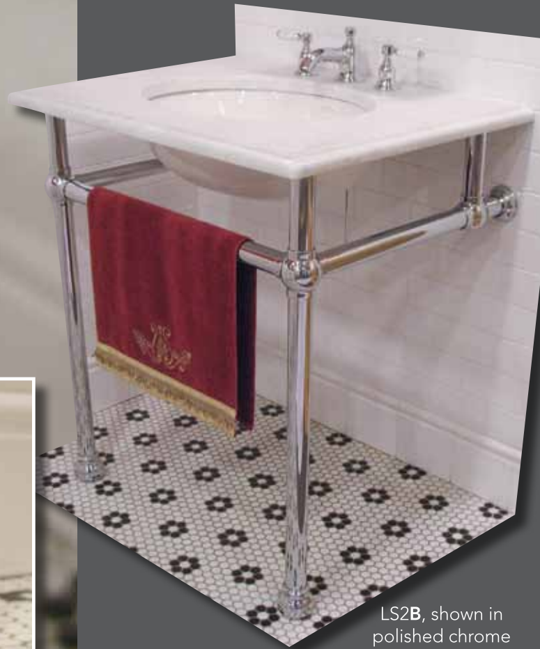
LS2B, shown in polished chrome