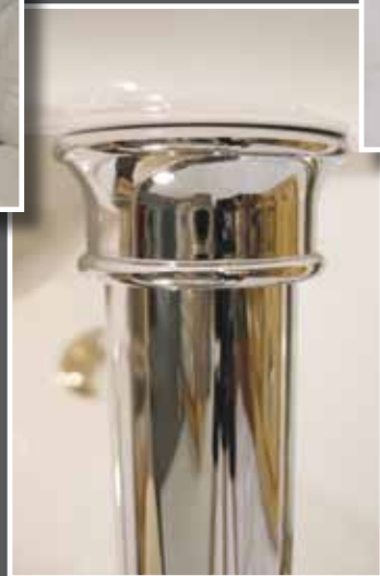
Leg Top Cap