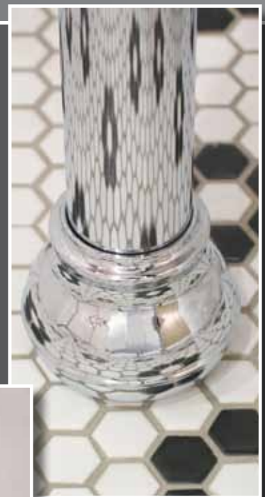
Bun Foot, CNC machined from a solid 5-pound piece of brass rod

See the complete line of Palmer Sink Leg Systems at your dealer or online at www.SinkLegs.com